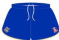
U Shorts Ladies Blue