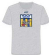
U Cotton Tee Light Grey