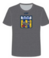
U Cotton Tee Dark Grey