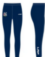
U Full Length Tights